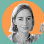
Tilla Kross Textile ETP