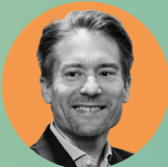
Lutz Walter Textile ETP